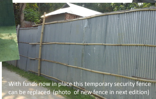
With funds now in place this temporary security fence can be replaced (photo of new fence in next edition)