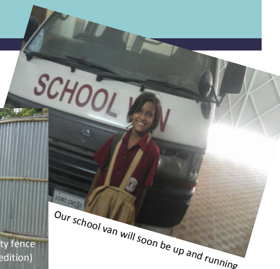
Our school van will soon be up and running