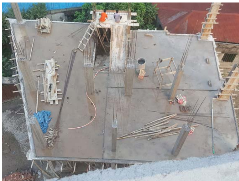
Construction at the new school project is now well advanced