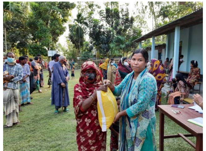
Our food hampers provide much needed aid

For our new school project and the start of Term 1 in January and for donations to cover the remaining funding gap.